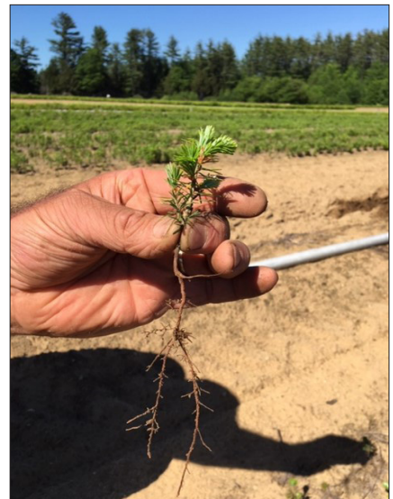
Sensor depth can be adjusted depending on the rooting depth of the crop.

To take readings using these sensors, growers need access to a digital data reader which simply connects with clips to the end of each wire lead. The cost of these readers was $210 at the time this publication was written. Each sensor costs $36, and a pair of two is recommended for each location. Having two sensors allows growers to better understand the effects of irrigation at varying depths within a planting or block. Sensor depth can be adjusted depending on the rooting depth of the crop.