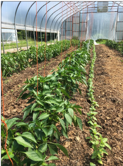
Using established recommendations for maintaining specific soil moisture levels based on soil types and crops, provides growers with additional information for irrigation decisions.

Established recommendations for soil moisture in specific crops and soil types are available. These recommendations provide growers with additional information on which to base their irrigation decisions. In most soils, other than heavy clay, the decision to irrigate would generally happen with sensor readings in the range of 20 to 40 kPa. Differences in soil type should be considered when determining the appropriate range for irrigation. This is because different soil types have varying levels of plant-available water at various soil moisture readings. To clarify, a soil moisture tension reading of 40 kPa in a sandy loam would mean that approximately 50 percent of the water in the soil is available to the plant. Comparatively, a loamy sand soil would have only 35 percent plant-available water at the same 40 kPa reading (see chart on page 3).