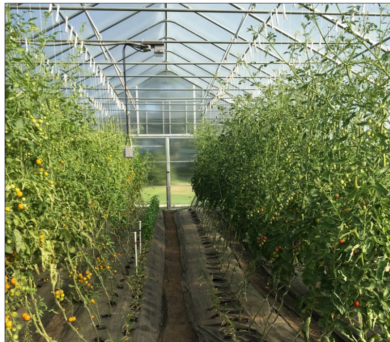
Soil moisture in high tunnels is primarily supplied via drip irrigation. Using moisture sensors can help assure that adequate soil moisture is being maintained, and alert growers when potential issues arise with the irrigation system.