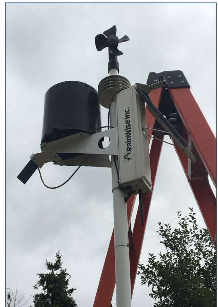
One of several weather stations located on various farms across New Hampshire that feed data into the Network for Environment and Weather Applications (NEWA).

The University of New Hampshire Cooperative Extension is an equal opportunity educator and employer. University of New Hampshire, U.S. Department of Agriculture and N.H. counties cooperating.