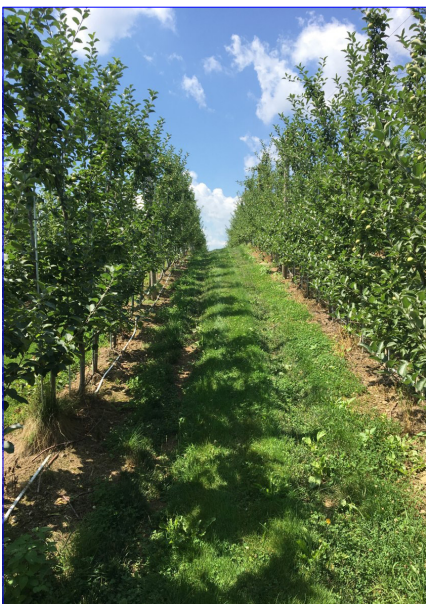
It is important to know the soil type, along with monitoring soil moisture and visually observing crops and soil to make an informed irrigation decision.

This reinforces the importance of knowing the soil type, along with monitoring soil moisture and visually observing crops and soil to make an informed irrigation decision. Additionally, the method of irrigation should also be considered. For example, it is recommended to begin overhead irrigation when the available soil moisture is no less than 50 percent, while drip irrigation, taking comparatively longer to distribute substantial volumes of water, could be started before the plant-available water drops below 80 percent. Using the sandy loam example from above, this would mean that a reading of 17 kPa would trigger a drip irrigation event.