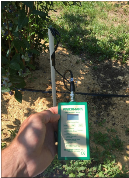
A handheld reader provides instant data useful for irrigation management decisions.

Ultimately, the reading we get serves as an indicator of how hard it is for the plant to pull water from the soil.