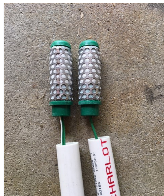
Soil moisture sensors are used to track soil moisture levels for better crop production.

The sensors have allowed growers to better understand the frequency and duration of irrigation events needed, for their soil moisture trends, to maintain adequate moisture based on the crops being grown.