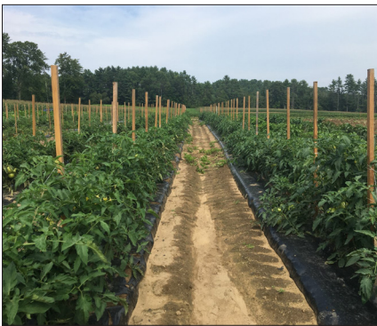
Soil sensors can be used for field crops or high tunnel crops.

Ultimately, the reading we get serves as an indicator of how hard it is for the plant to pull water from the soil.